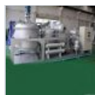
Car Oil Recycling Machine